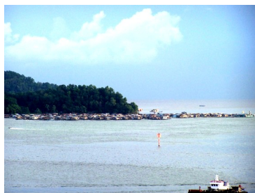
Sea Gypsies off Kota Kinabalu

Queensland Laraine Edwards Ph : 07 3396 6705