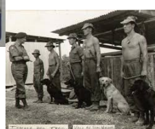
Fire Base "Senam"

COMRADESHIP for those who served in Malaya, Sabah, Sarawak, Singapore, the Thai-Malay Border, Brunei, the MALAYAN EMERGENCY, the INDONESIAN CONFRONTATION.