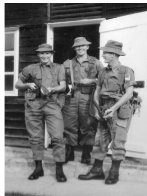
Back in '67....