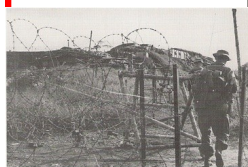
Bukit Knuckle base