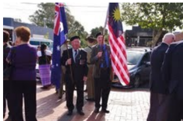
A fine body of Troops represented Victoria at the annual Werribee march