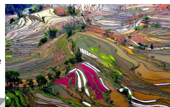
Terraced rice fields, China