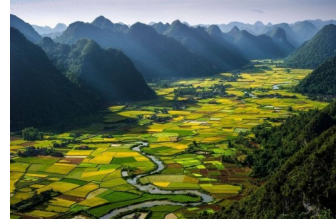
Bac Son Valley, Viet Nam