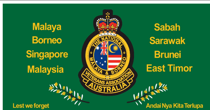
The official banner of the NMBVAA Inc

This the official Banner of the NMBVAA Inc. It has been in effect since 2007/8. Every State Branch and Sub-Branch was advised that a special subsidised price was available to purchase through NHQ at the time in Canberra. The former banner is obsolete., and it should not be used.