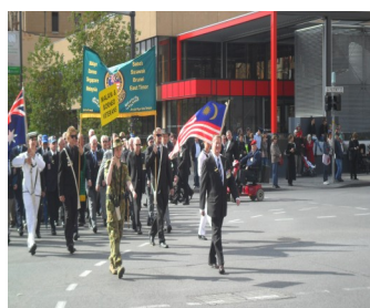
RAN Cadets were the national flag bearers and a Army Cadet carried the identification sign.