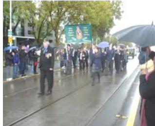
Victoria members on the march in the wet