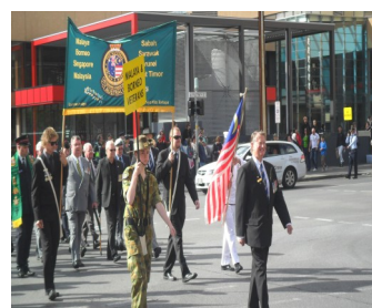
64 formed up behind the Banner