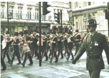
These pics are of the combined Ex-service and serving personnel