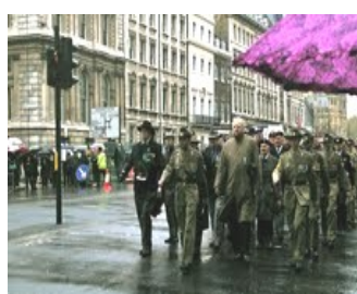
Australian and New Zealand on the march in London.