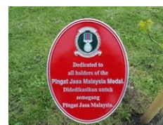
UK Memorial plaque