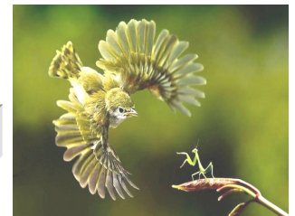
The last Great Act of Defiance.....