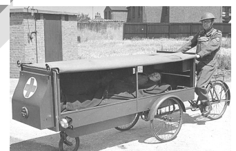
WW2 Army Ambo !!

Doors have a subliminal effect that can be very unnerving as we get older.....Ever walk into a room and forget what for? Turns out doors are the cause of this strange memory lapse. Psychs at Uni of Notre Dame have discovered that walking through a door triggers a mini "event boundary". Your brain files away the thoughts from the previous room creating a blank slate for the next locale. So, it's NOT age, it's those bloody doors mate! Chee Woh