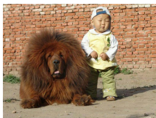
Now, THAT'S A DOG !!! Tibetan Mastiff