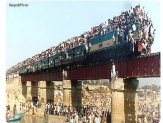
Indian train travel