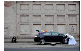
Poor Groom has a bad back....