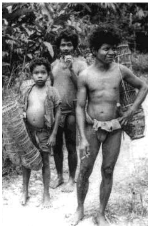
MALAYA 1957 THREE GENERATIONS OF SAKAI GRANDFATHER, SON, AND GRANDSON