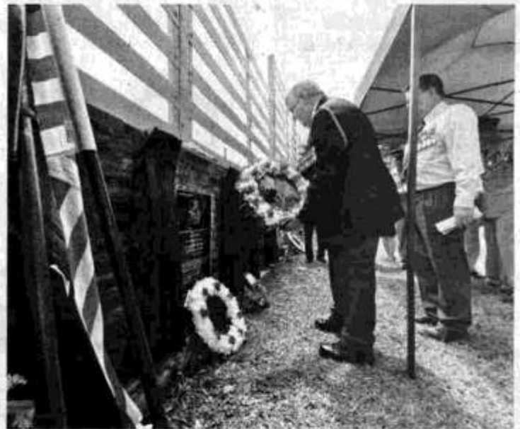
NMBVA army veterans placing wreaths at the Heroes Cemetery.

Also present during the event were Minister of Transport Datuk Lee Kim Shin, High Commissioner of Australia