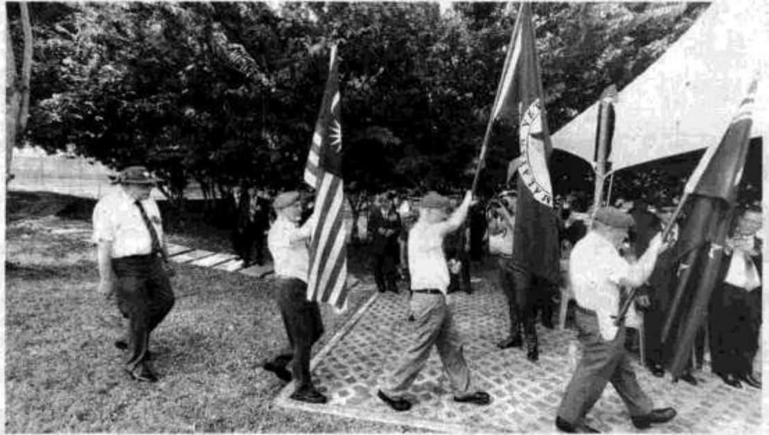
Veterans marching on the Colours at the end of the ceremony.

"Australia's commitment to both campaigns in Malaya fell within the context of its membership of the British Commonwealth Far East Strategic Reserve (BCFESR). In 2011, the Australian Department of Veterans' Affairs designated Aug 31 which is the date of Malayan Independence in