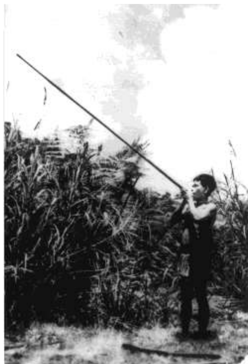
MALAYA 1957 A SAKAI HUNTER