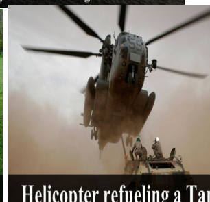
Helicopter refueling a Tank