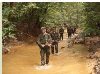
"Dear Mum & Dad." ...Dec '65