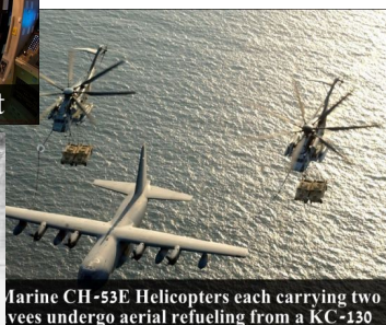
Marine CH-53E Helicopters each carrying two vees undergo aerial refueling from a KC-130