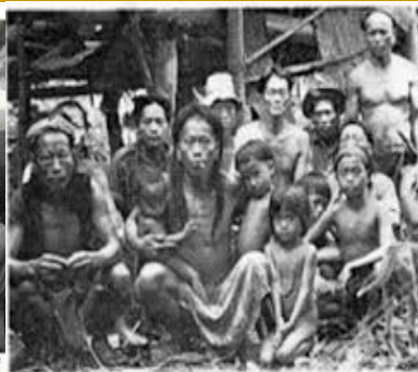
A platoon group, thinly disguised as Punans of Third Division, Sarawak