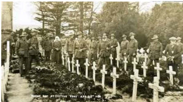
WW1 AIF graves 1918