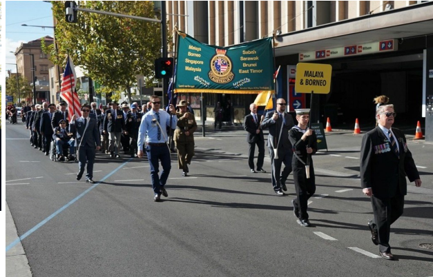
SA & NT Branch