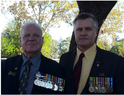
Father & Son