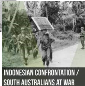
INDONESIAN CONFRONTATION / SOUTH AUSTRALIANS AT WAR