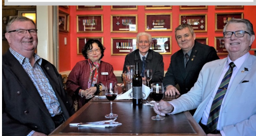
Pre-lunch refreshments NM&AF Club Adelaide