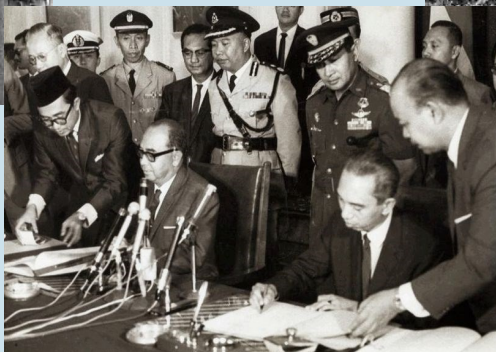
Adam Malik Indonesia