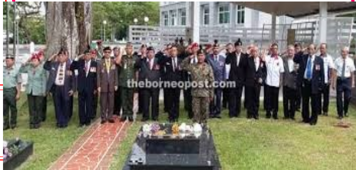
Heroe's Graveyard and Memorial Garden Jalan Taman Budaya, Kuching, Sarawak.

The research for the Nominal Rolls of the RAN and RAAF members who served during either the Malayan Emergency or, the Indonesian Confrontation has been commenced.