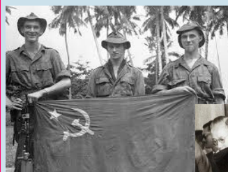
Tun Abdul Razak Malaysia

55th Anniversary 11 August, 2021 Jakarta, 11 August, 1966