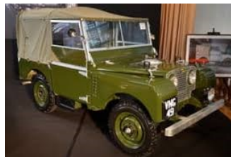
Mk1 SWB fully restored is available at auction for AUD$30K- AUD$45K