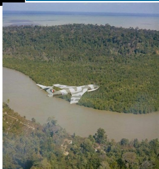
RAF Victor bomber low and level over the Peninsula during Operation "CHAM".....1965