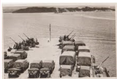
HMAS Sydney 111 entering Jesselton Harbour, Sabah, June 1964...