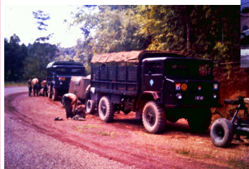
111 Bty RAA enroute to China Rock with the sea passage by RASC Small Ships 1965...