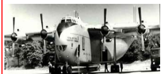
RAF Blackburn Beverley, Seletar 1965.....