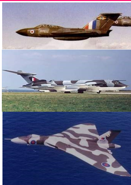
RAF Javelin, Victor & Vulcan from of our time.....Indonesian Confrontation war.....