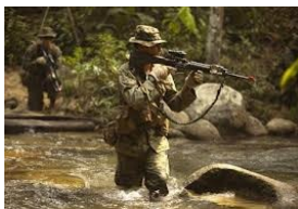
Water, water everywhere

Phone: 08 8387 1672 Mob: 0416 118 843 E: oneoneecho111@gmail.com