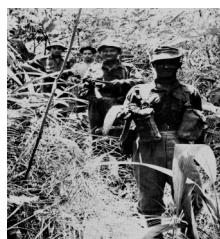
6 Gurkha Regt Patrol