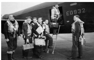
"G George" aircrew 16 May 1943 and ED825/G