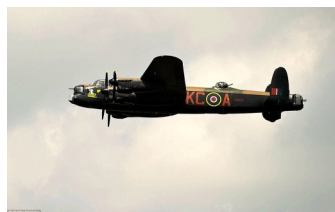
RAF Memorial Flight