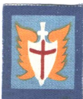
FARELF colour patch FAR EAST LAND FORCES worn by 111 Bty RAA

Phone: 08 8387 1672 Mob: 0416 118 843 E: oneoneecho111@gmail.com