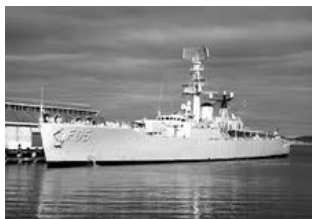
HMAS Parramatta F05 Joined with HMAS Yarra F07 to escort HMAS Sydney to Sabah and Butterworth, May /June 1964.....

COMRADESHIP for those who served in Malaya, Sabah, Sarawak, Singapore, the Thai-Malay Border, Brunei and Timor during WW2, the MALAYAN EMERGENCY and during the INDONESIAN CONFRONTATION post WW2.