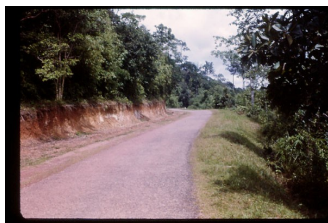
Thai-Malay border Area of Ops, 64-66, for 3RAR, 4 RAR and 111 Bty RAA with 17 Gurkha Division Infantry companies