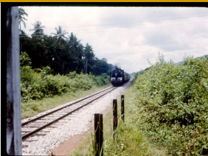
Main (single) line between Singapore and Prai 1964.