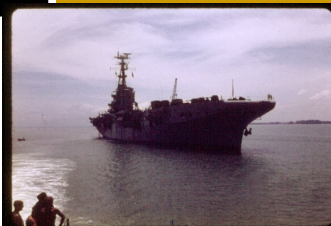
HMAS Sydney unloading 7 Fd Sqn RAE at Jesselton, Sabah, June 1964.