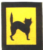
17 Gurkha Div colour patch worn by 111 Bty RAA