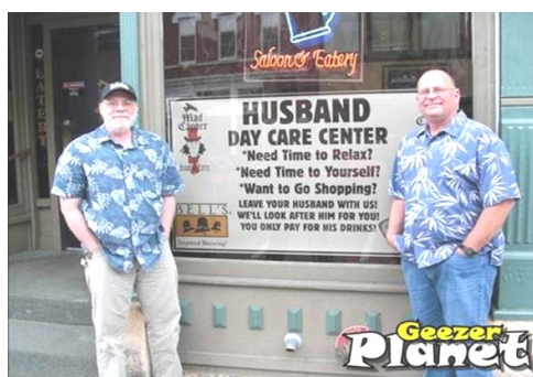
EVERY ESO should have one..... Fido