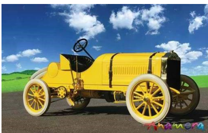
World's first convertible 1904 Thomas Flyer