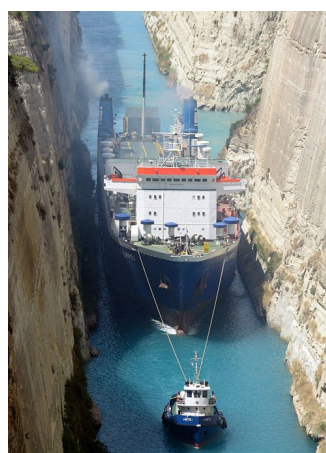
Corinth Canal Greece

deployments/secondments. One aggravating side effect of this "record keeping" has been the extended delays caused to many applications for disability pensions. In some instances, the applicants/members, have to confirm their degree of injury all over again because of the difficulty in locating unit medical records. A submission to compile the Nominal Rolls for all personnel who served in these campaigns will again be put to the incumbent Minister. Ed.