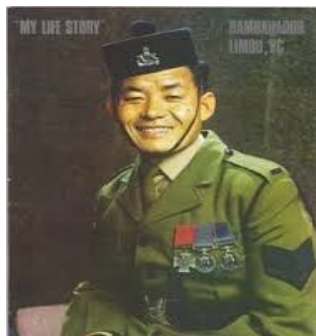
Sgt Rambahadur Limbu VC 23 SEPT 1965 action near Bau, Sarawak