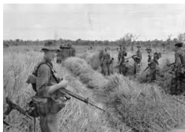
4 RAR '66