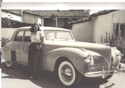
1941 Ford Lincoln Continental