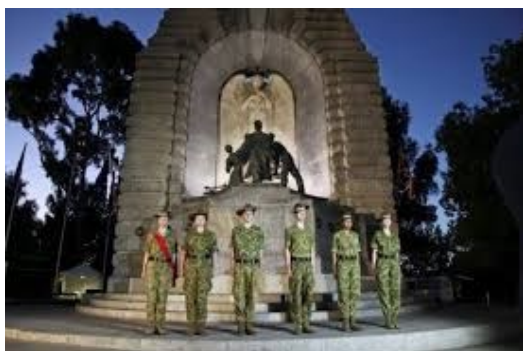
Dawn Service Adelaide