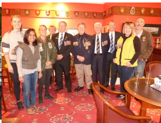
Group pic after the march at the Naval, Military &amp; Air Force Club...Hutt St Adelaide