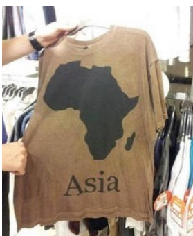
Not even close.....

THE NATIONAL MALAYA & BORNEO VETERANS ASSOCIATION AUSTRALIA INCORPORATED