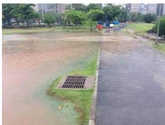
Drainage level problem here....