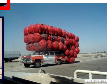
A high cube capacity trailer would be very helpful here....