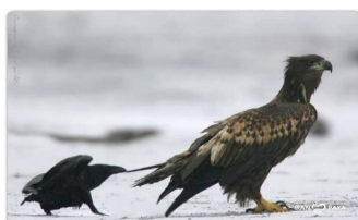
A last great Act of Defiance or, suicidal tendencies....???