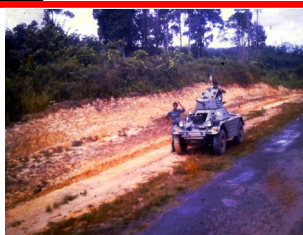
Malaysian Army Recon Regt scout car and returning 111 Bty RAA patrol, Thai-Malay Border 1965.

All original pics and documents will be returned to the sender..... Ed.