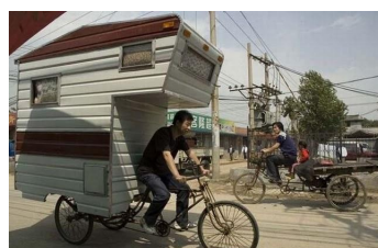
THIS is innovation.....