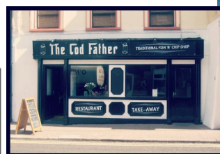
A disappearing feature of our heritage....traditional fish & chips shops.....(UK)....