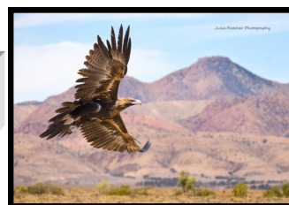
Wedge tail Eagle over the Flinders Ranges South Aust.