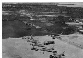
77 Sqn RAAF Borneo